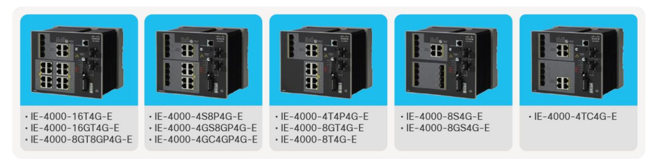
Figure 1. IE 4000 models

Figure 1 shows the switch models, Table 2 lists all the available Cisco IE 4000 Series models, Table 3 lists the power supplies for Cisco IE 4000 Series Switches.