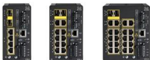
Figure 1. IE-3100 Rugged Series switches models