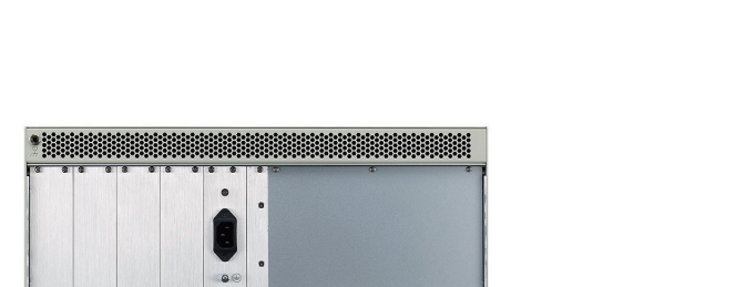
CPCI PSU Rear side