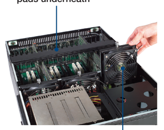
Three 114 CFM hot-swappable fans