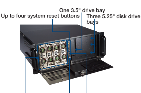
Hot-swappable Power Alarm reset button Alarm reset