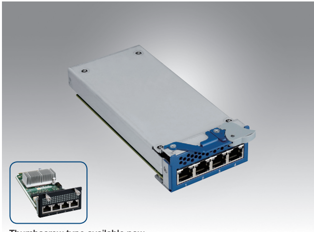
Thumbscrew type available now